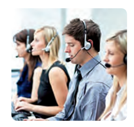
Doing listening practice tests