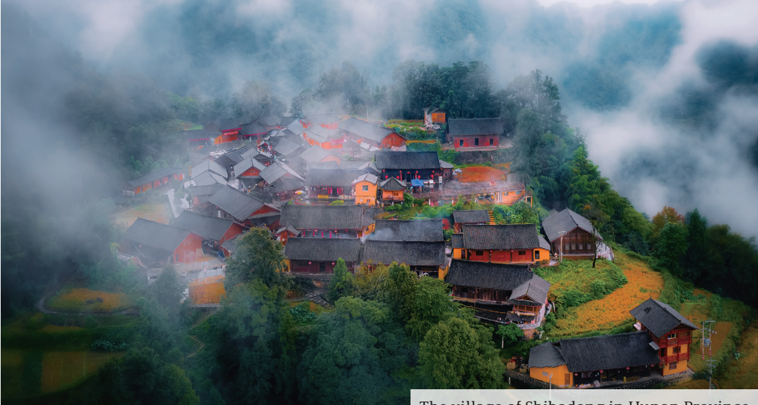
The village of Shibadong in Hunan Province

Read the passage to have a comprehensive understanding of how China succeeded in shaking off poverty, and then complete the online and classroom activities.