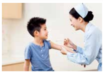
hospital; take care of patients