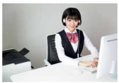
e-commerce training room; do business online