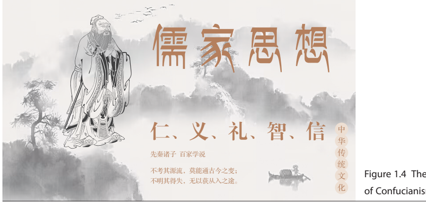
Figure 1.4 The core of Confucianism.