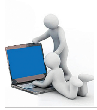
Figure 1.1 Media power.

When discussing media power, we refer to the interconnections between social actors, institutional structures, and the larger contexts of society, which are all involved in the allocation of symbolic resources to format specific influence. According to Des Freedman Goldsmiths (Professor of media and communication studies in the University of London), the relational conception of media power is constituted by four dimensions of related media scholarship: consensus, chaos, control, and contradiction.