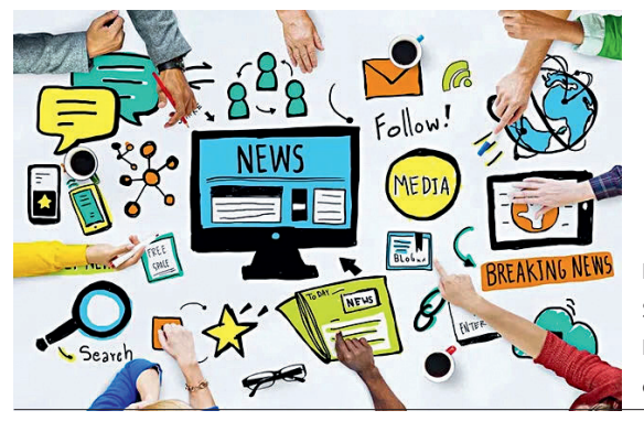
Figure 1.2 Network-based media.

must still comply with the content guidelines set by either corporations or state authorities. As a result, new patterns of information flow have emerged where the power appears to be in the hands of the public, rather than the media corporations or state authorities.