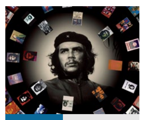
Language and culture