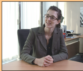
Director of HR Department of a leading international corporation