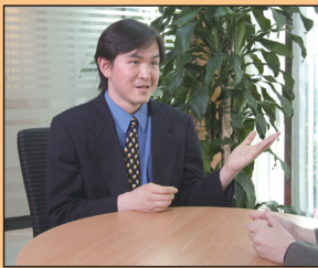
A university senior student