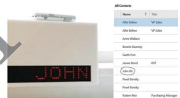
3 Phone alarm clock