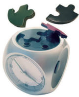
1 Puzzle alarm clock

Can you guess how the following alarm clocks work? Discuss it with your partner and write down your ideas.