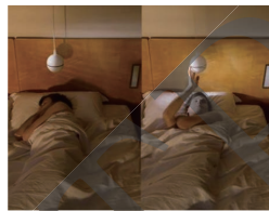
2 "Ladder" alarm clock