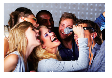
go to KTV after the final examination ¥150