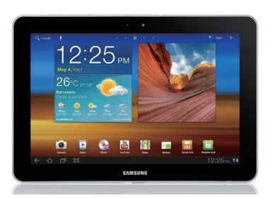
buy a tablet