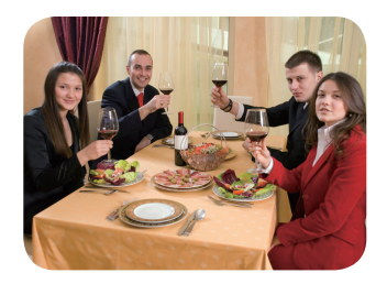
eat out with friends