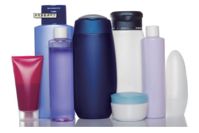
buy skincare products